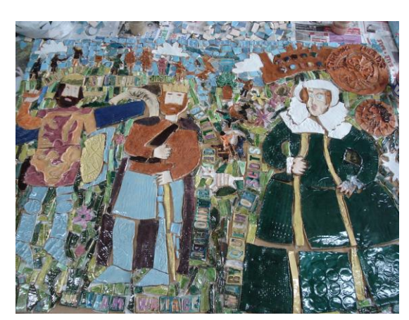
'Bannockburn Mosaic by Bannockburn Primary School

Reverb and Reveal Scotland, national arts development programmes building capacity for and supporting disabled musicians and artists to develop their individual and sector ambitions.